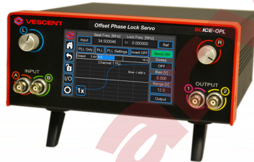
SLICE-OPL Offset Phase Lock Servo